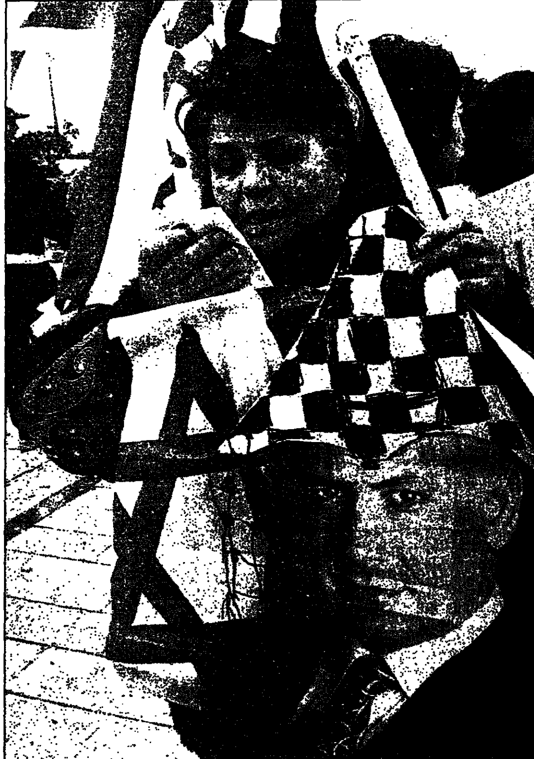
A demonstrator weeps at a protest against the agreement in Jerusalem yesterday.

and responsibilities that have yet to be transferred to the Palestinian side in the city of Hebron (12 spheres) in accordance with Article VII of Annex I to the Interim Agreement shall be conducted concurrently with the beginning of the redeployment of Israeli military forces in Hebron.